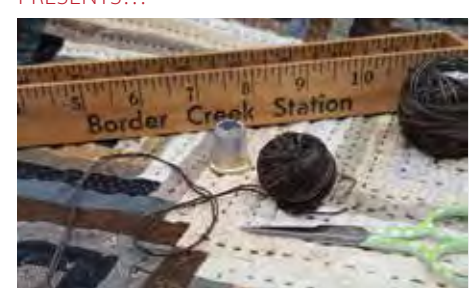
I LIKE BIG STITCH, I CANNOT LIE!

Yes, we do! Big stitch is the new quilting stitch, but easier. Find out what it's all about in demos filled with hints, tips and