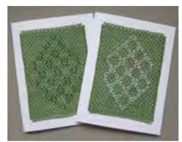
Two Trendy Trees - Kit $7 (make one card today and another at home) Thurs 12:30 - 1:15 Fancy Fence Coaster - Kit $7 Fri 12:30 - 1:15 Double Diamonds - Kit $7 make one card today and another at home) Sat 12:30 - 1:15